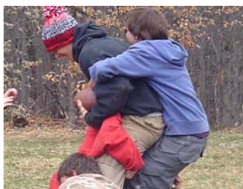
Football game at the Fellowship Weekend