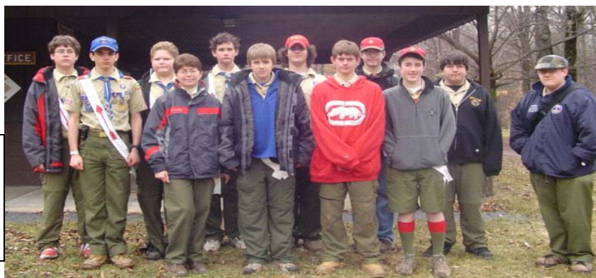
OA members who sealed their membership in Brotherhood at the Fellowship Weekend.