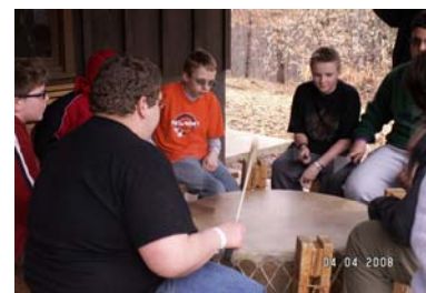
Lots of drum practicing at the Fellowship Weekend