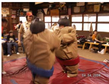
Sumo wrestling at the Fellowship Weekend